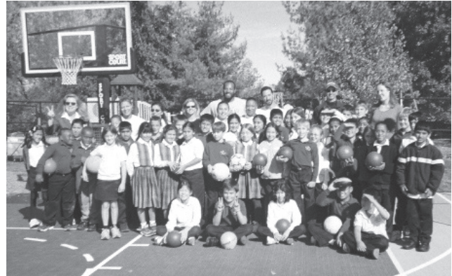
Students, teachers and parents at the Jefferson School show their support for ending homelessness.