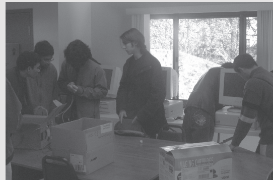
Edison HS students install the new computer lab at Seneca Heights Apartments.

Seneca Heights is home to forty individuals and seventeen families exiting homelessness. Prior to the donation, there were only four computers available for resident use. With the new lab, our residents will be able to more easily job search, research on the internet, complete school work, and play games. The new lab is located in the main community room, which is the site of many SHA activities, including twice-weekly tutoring for the school-age children.