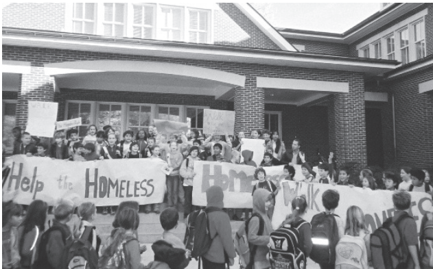
Somerset students chant "We Walk, We Talk, We Care, About Homeless People Everywhere!"

MCCH supporters joined tens of thousands of people for Fannie Mae's 18th Annual Help the Homeless Walkathon. In addition to raising funds to prevent and end homelessness, a significant element of this program is raising awareness about homelessness in our area. This past fall, MCCH alone engaged more than 4,700 youth through mini-walks at local schools, educational presentations and service projects. We are grateful to all the schools that participated in our youth engagement efforts, to our corporate partners for their generous support, and to Fannie Mae for making this wonderful program possible.