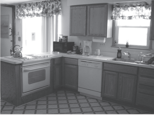
Laytonsville's newly renovated kitchen.

The houses at the Laytonsville Safe Haven have received a makeover thanks to Montgomery County's Department of Housing and Community Affairs. The front house has a new roof, exterior siding and an updated kitchen. The "back" house also has a new roof, a rebuilt sun room and a new heating and cooling system. Paved driveways have been added to both houses and they are now connected by a new cement walkway. Residents and staff are very pleased with the changes. The Laytonsville Safe Haven now has two fresh, modern, user-friendly houses conducive to providing mentally ill adults a healthy, supportive living environment.