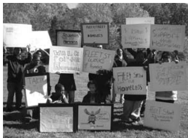
Fleet Street Elementary School.