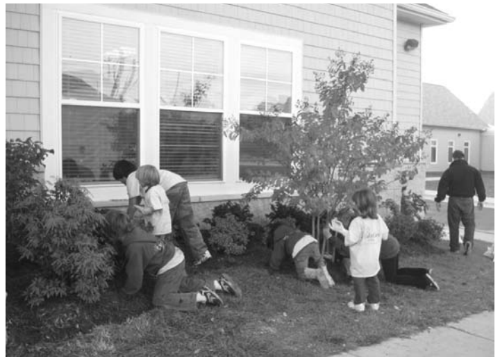
Children and youth from KidzCare USA help make the HBCAC a more attractive place.

Congratulations and thank you to KidzCare for giving us their time and talents.