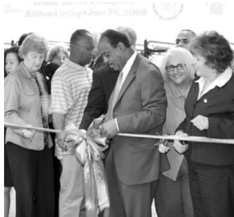
County Executive Isiah Leggett cuts the ribbon as others look on.