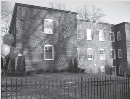
Exterior view of Dale Drive Apartments.