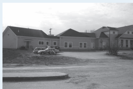
HBCF constructed a 3,780 sq. ft. addition to meet increased demands for shelter and services.