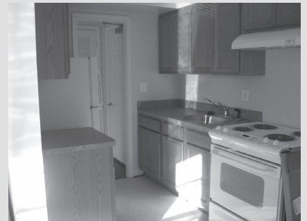
The same kitchen post-renovation.

HBCF teamed up with MCCH in 2007 to develop permanent supportive housing for disabled adults who have experienced homelessness for long periods of time. Led by builder captain Maryland Development Co. LLC/Ridan Builders Inc., HBCF contributed $200,000 of in-kind labor and materials and cash contributions to renovate a vacant three-story brick building in Silver Spring. Dale Drive Apartments now offers eight one-bedroom units for single adults as well as access to a range of services providing residents the opportunity to live with stability, autonomy, and dignity.