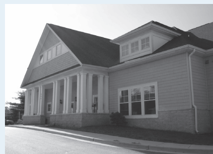
The facility built in 2000 by HBCF drastically improved conditions for homeless men in Montgomery County.