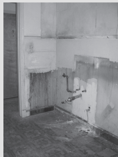
A kitchen pre-renovation.