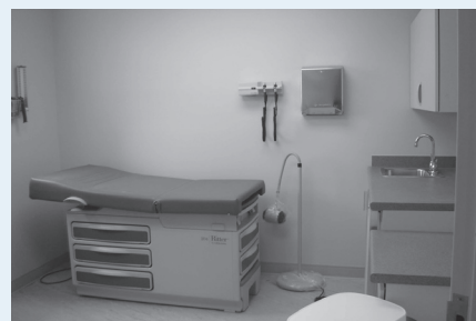
The addition includes two medical exam rooms.